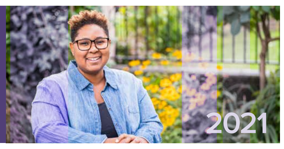
Learn more about the plan: cpp.pensionsbc.ca